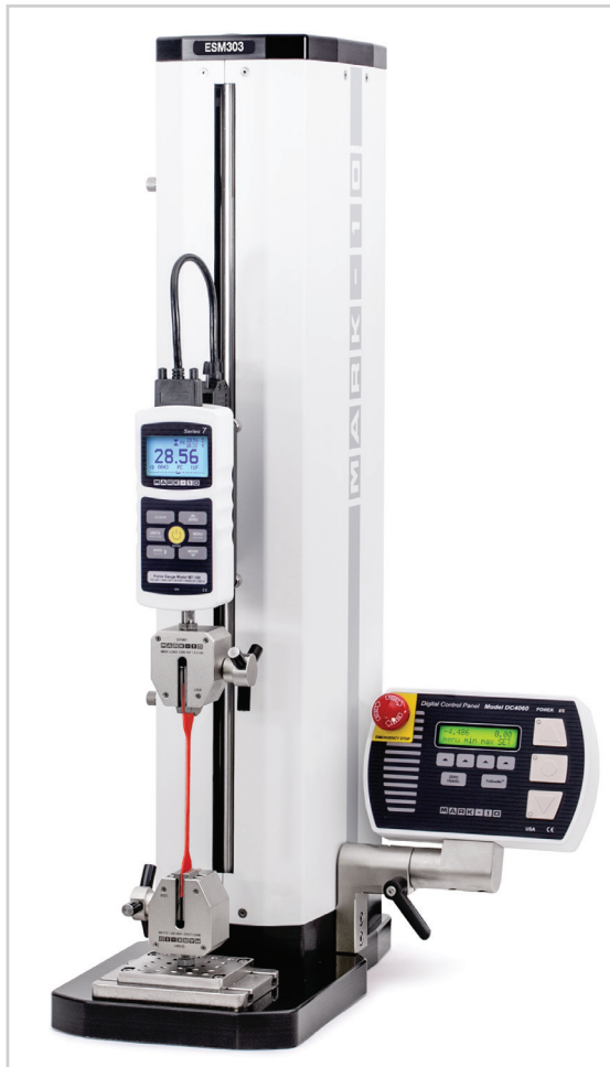
^ ESM303 is shown above configured for a tensile test, with a Series 7 force gauge and G1061-2 wedge grips.

The ESM303 is a highly configurable single-column force tester for tension and compression measurement applications up to 300 lbf [1.5 kN], with a rugged design suitable for laboratory and production environments. Sample setup and fine positioning are a breeze with available FollowMe™ force-based positioning - using your hand as your guide, push and pull on the force gauge or load cell to move the crosshead at a variable rate of speed.