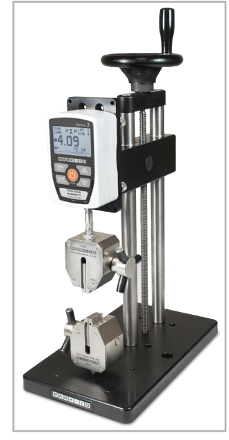
Shown with an ES20 test stand and G1061 wedge grips

Series 3 gauges include MESUR™ Lite data acquisition software, for tabulation of continuous or individual data points. One-click export to Excel button easily allows for further data manipulation.