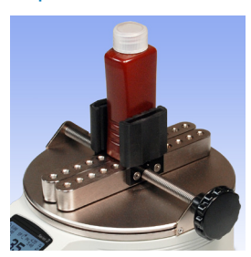
CT001 Flat jaws Set of rubber jaws for gripping square or odd shaped containers.