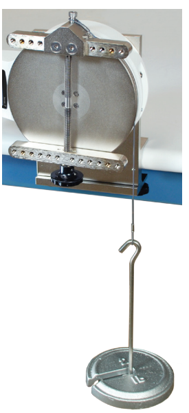
Calibration kit Complete set of brackets, cable, and hardware for calibration of any Series TT01 torque tester. Weights not available from Mark-10.