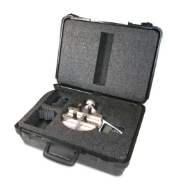
CT002 Carrying case Provides storage space for the TT01 tester, gripping jaws, AC adapter, and accessories.