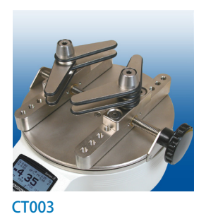
Adjustable jaws Rubber-edged arms may be independently repositioned to accommodate unique samples.