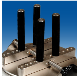
CT005 / CT006 / CT007 Extended length post sets

CT005: Four 2.5" (63 mm) posts CT006: Four 4" (101 mm) posts CT007: Kit of four of each length: