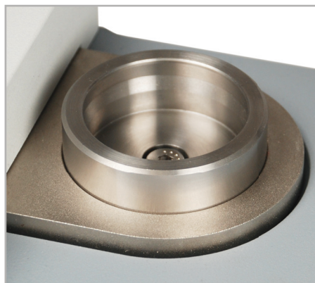
WT3003 Machinable blank terminal fixture

Secures ring terminations. Pin diameters from 1/8 to 3/8 in [3.2 to 9.5 mm].