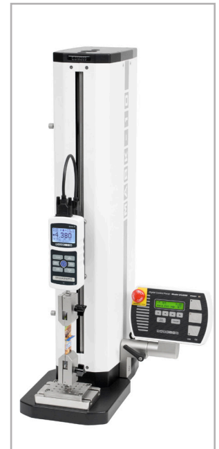
Shown with an ESM303 test stand and G1008 film & paper grips

On-board data memory for up to 50 readings is included, as are statistical calculations with output to a PC. Integrated set points with indicators and outputs are ideal for pass-fail testing and for triggering external devices such as an alarm, relay, or test stand. The gauges are overload protected to 200% of capacity, and an analog load bar is shown on the display for graphical representation of applied force.